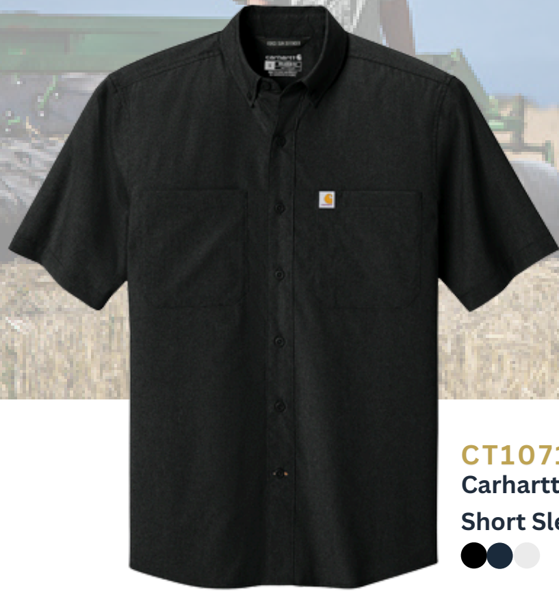
CT107107 Carhartt Force® Sun Defender Short Sleeve Shirt