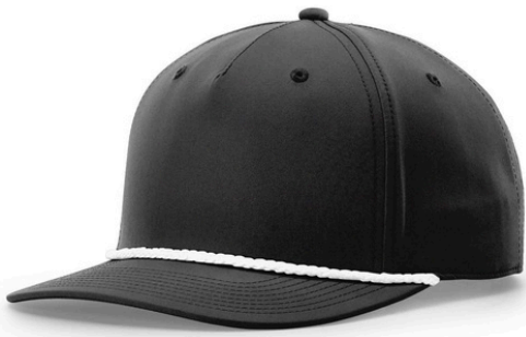
258 5Richardson Panel Classic Rope Cap