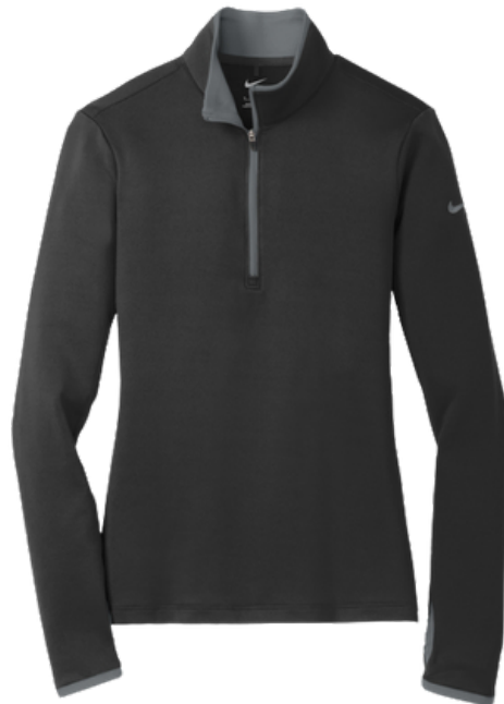
779796 Nike Women's Dri-FIT Stretch 1/2-Zip Cover-Up