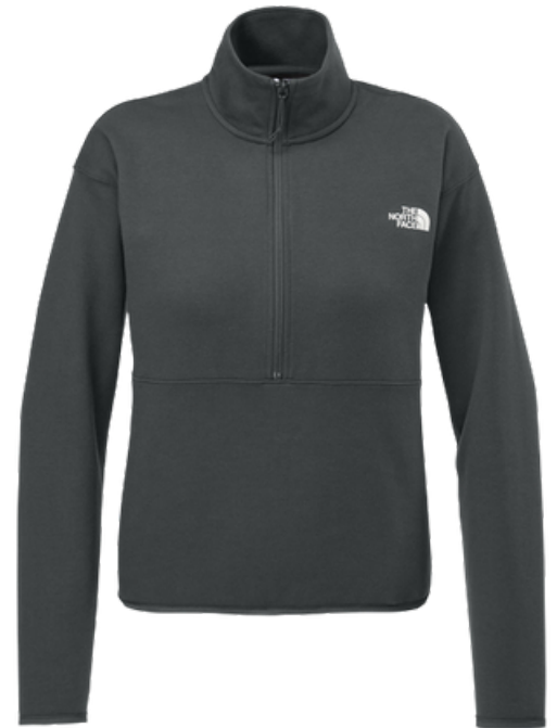
NFOA8C5H The North Face® Women's Double-Knit 1/2-Zip Fleece