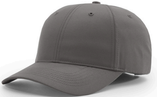
336 Richardson Burnside Cap