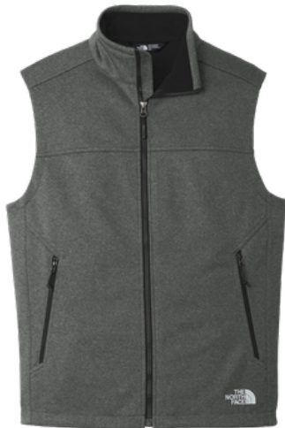
NFOA3LGG The North Face- Ridgewall Soft Shell Vest