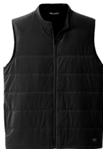
TM1MW453 TravisMathew Cold Bay Vest