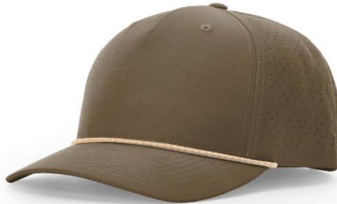
355 Richardson Laser Perf Performance Rope Cap