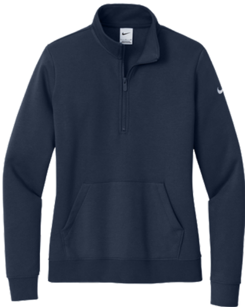
400099 Nike Women's Club Fleece Sleeve Swoosh 1/2-Zip