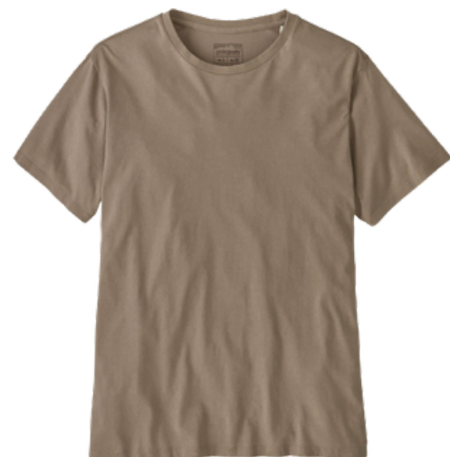
42185 Patagonia Unisex Daily T-Shirt