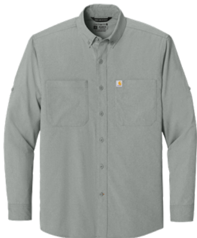
CT107106 Carhartt Force® Sun Defender™ Long Sleeve Shirt