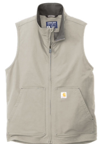
CT105535 Carhartt® Super Dux™ Soft Shell Vest