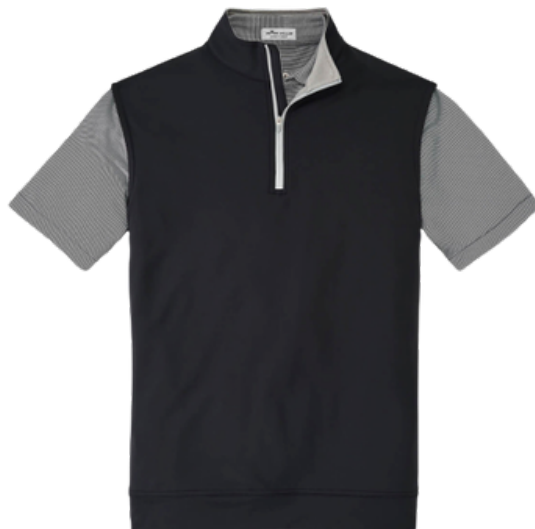
MEOEK41 Peter Millar Men's Galway Performance Quarter-Zip Vest