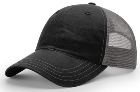
111 Richardson Garment Washed Trucker Hat