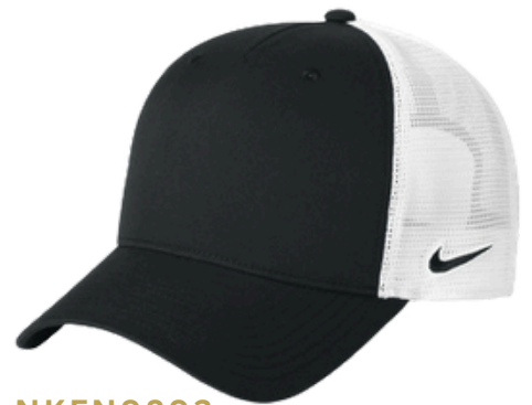
NKFN9893 Nike Snapback Mesh Trucker Cap