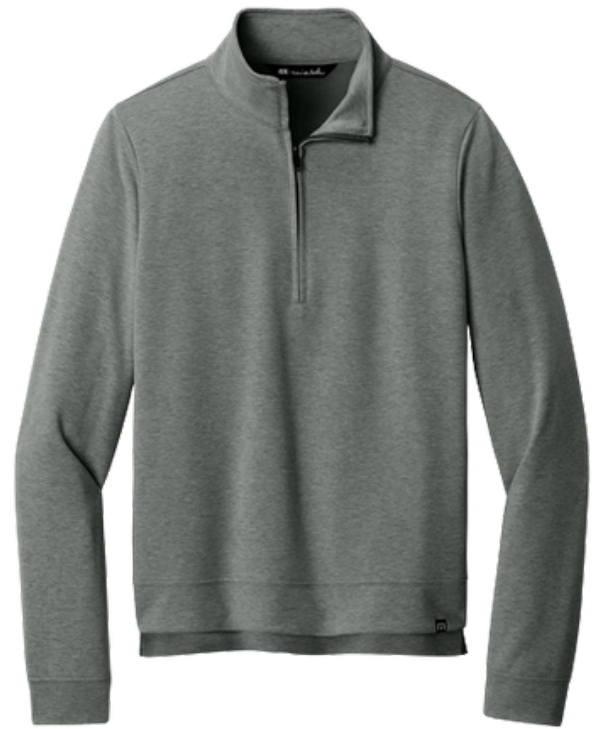
TM1LD007 TravisMathew Women's Coveside 1/2-Zip