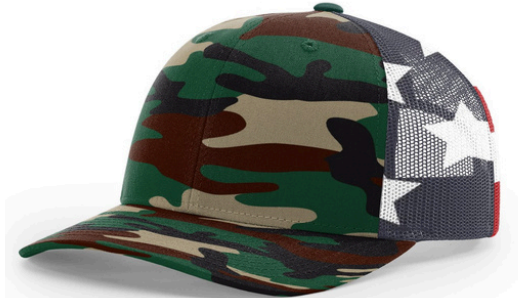
112PM Richardson Printed Mesh Trucker Cap