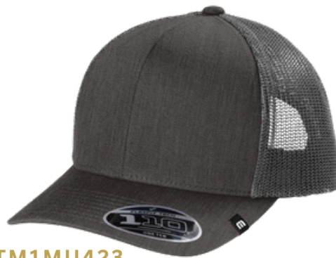
TM1MU423 TravisMathew Cruz Trucker Cap