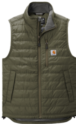
CT102286 Carhartt® Gilliam Vest