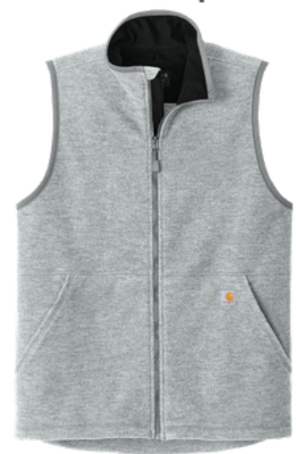
CT106418 Carhartt® Textured Fleece Vest