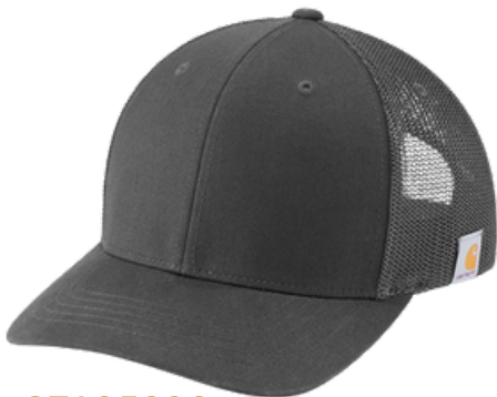
CT105298 Carhartt® Canvas Mesh Back Cap