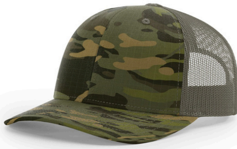
112PFP Richardson Five-Panel Printed Trucker Cap