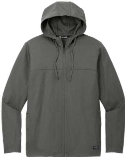
NKFQ4761 Nike Pro Hooded Jacket